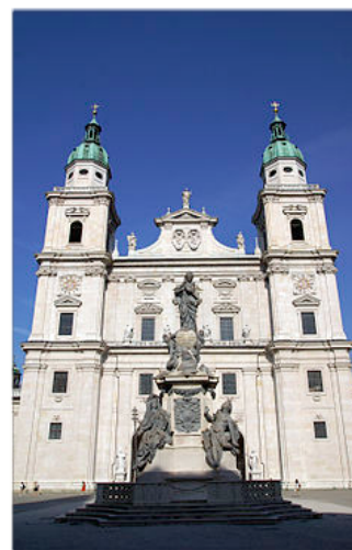
Salzburg Cathedral, Austria