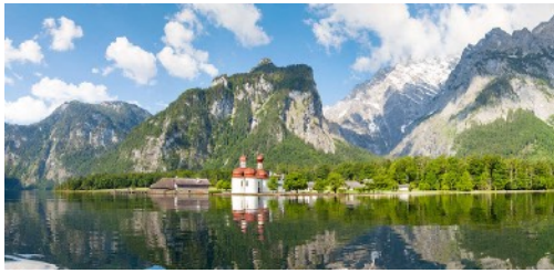
Austrian Alps - Königssee