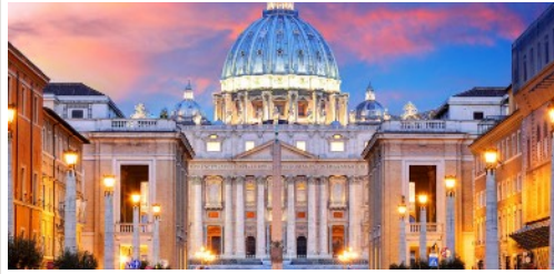
St. Peter's Basilica