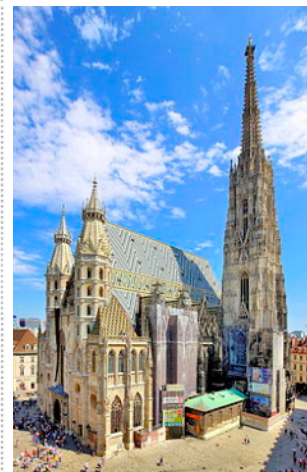
St. Stephens Cathedral, Vienna