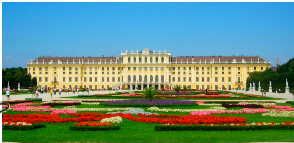
Schonbrunn Palace, Vienna