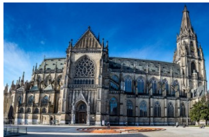
Linz Cathedral, Austria